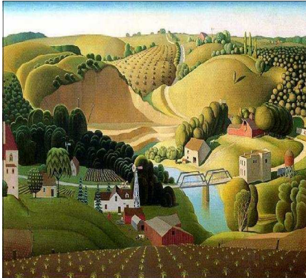
Stone City, Iowa 1930