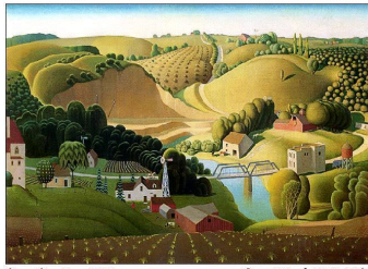
Stone City, Iowa 1930 Grant Wood, 1891-1942 Citizens United for Responsible Land Use