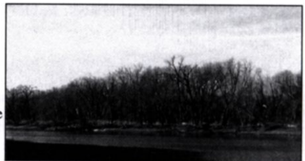
Section of Des Moines River included in proposed extension.

The coalition includes neighbors, conservationists, mountain bikers, planners, and others opposing the proposed extension of MLK Parkway. The extension would run north from Euclid Avenue through a flood plain along the Des Moines River and connect with Interstate 80. In addition to its impact on a popular natural area having tremendous untapped potential, the coalition is concerned about the road's impact on farmland in the unincorporated area north of Interstate 80 and about the continued drain of people and tax base from the urban core. If you are interested in getting involved with this project, give Phil a call at (515) 288-5364.