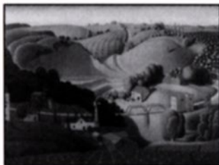
Grant Wood, Stone City, Iowa 1930