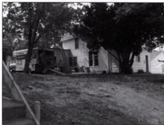
...this was the scene in June. The family moving in was "so excited" to be able to buy a home in the neighborhood.