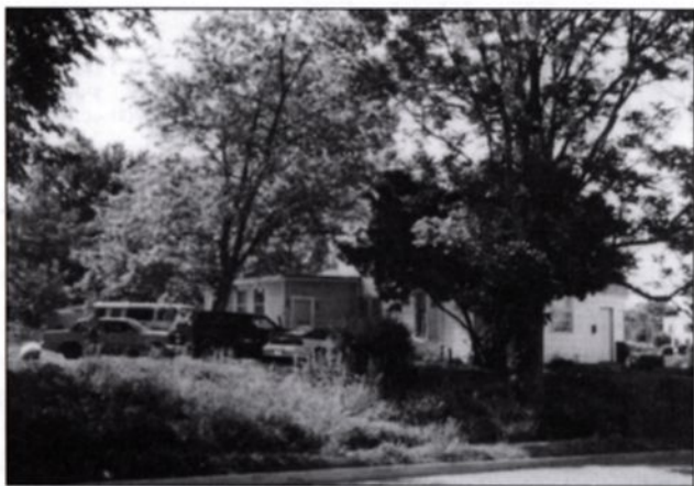
This house had been empty for many years, but...