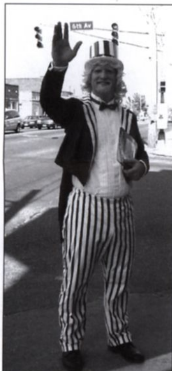
Uncle Sam greets his people and delivers directories to Highland Park businesses.