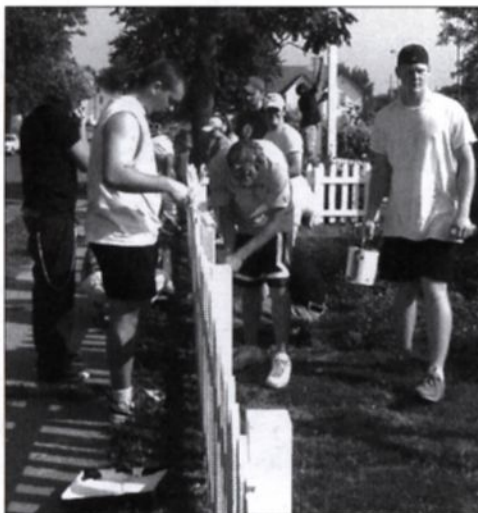
Our garden gets a white picket fence.