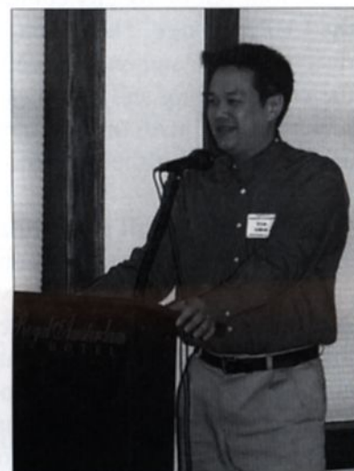
Don Chen, Executive Director of Smart Growth America, briefed the audience on activities and national legislation, transportation policy, and land-use issues before the U.S. Congress.