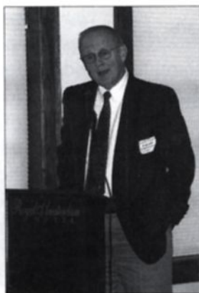
Pella Mayor Darrell Dobernecker greeted about 90 attendees.