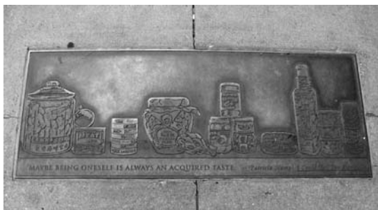
Above: Iowa City was recently named a City of Literature by UNESCO, one of only three designated as such in the world. Bronze plaques, embedded in downtown sidewalks, honor 49 authors associated with Iowa.