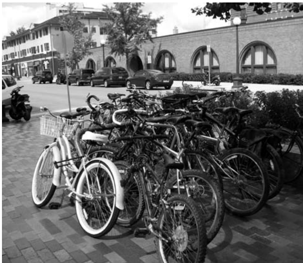
Left: Bicycles are a popular means of transportation in Iowa City.