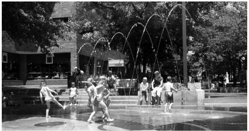
Above and right: One of many reasons for the success of the pedestrian mall is the variety of activities available for all ages.

Over 50 members and supporters of 1000 Friends attended this year's annual meeting in Iowa City. Attendees had an opportunity to enjoy the local farmers market and learn more about recognizing and supporting sustainability from the day's speakers, presentations, and panel.