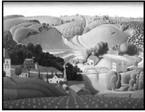
Grant Wood Stone City, Iowa 1930

Citizens United for Responsible Land Use