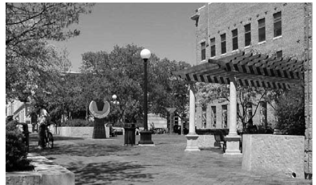
Below: Annual meeting participants toured the Iowa City downtown pedestrian mall.