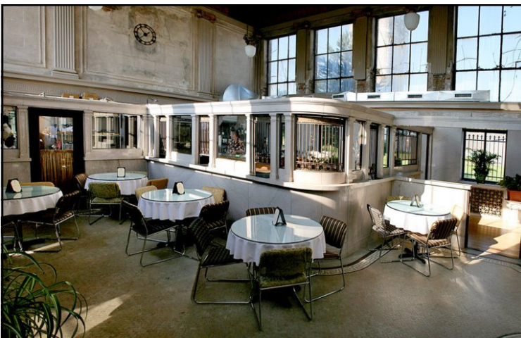
Above: Dining room of the Ladora Bank Bistro