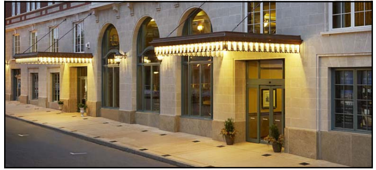
Above: Front view of The Hotel Julien Dubuque

The Hotel Julien Dubuque was selected to receive the award for Best Renovated Commercial/Civic in a large community because the beauty and authenticity of this historic rehabilitation project showcases how such rehabilitation can revitalize and sustain a downtown area. Visit http://hoteljuliendubuque.com to learn more about The Hotel Julien Dubuque.