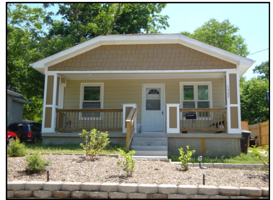
Above: Affordable home from the Greater Des Moines Habitat for Humanity

Visit http://www.gdmhabitat.org/ to learn more about the Greater Des Moines Habitat for Humanity.