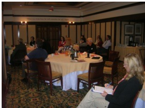
Attendees listen during the workshop

Each presentation offered unique perspectives from personal experiences complemented with facts and figures from many areas of expertise.