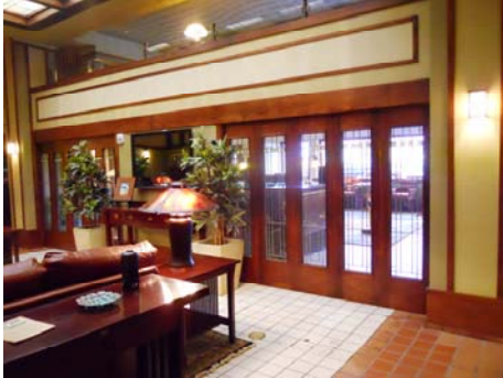
Above: View of lobby during the Historic Park Inn Hotel Tour