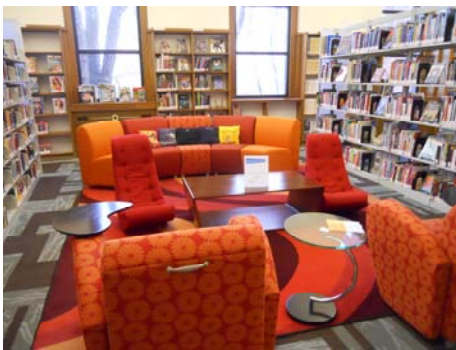
Above: The children's area of the library is warm and welcoming, complete with child size furniture.