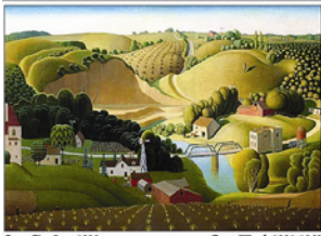
Small City, Iowa 1930 Grant Wood, 1891-1942 Citizens United for Responsible Land Use

Non-profit Organization U.S. Postage PAID Des Moines, IA Permit No. 4996